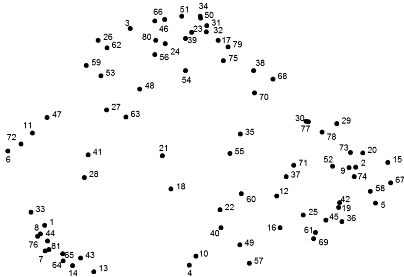
Figure 1 — The point map pictorially displays the 81 fun-determinants that were brainstormed and sorted by players, parents, and coaches. Points that are located closer to one another on the map are more similar to one another than points located more distally from one another.

We performed several iterations of the cluster replay map which successively displayed maps with fewer and fewer cluster-solutions. Cluster maps with 7, 8, 9, 10, 11, and 12 cluster-solutions were examined more closely conceptually. It was determined that of these maps, those with a greater number of clusters generated more specific themes which lend more easily to action-oriented pro-